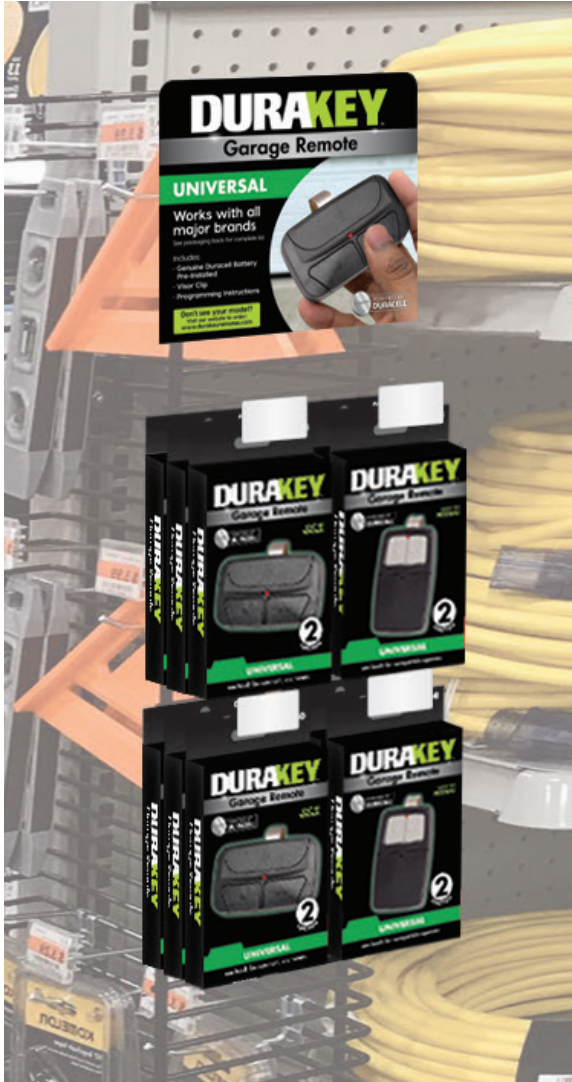
SIDEKICK HEADER 6-3/8" x 5-1/2"