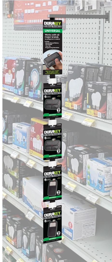
CLIP STRIP Holds 8 units